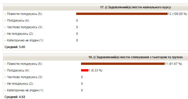
Figure 12: Quality assessment of on-line course by the students.

the ease of navigation and quality of interactive exercises and image quality. 3