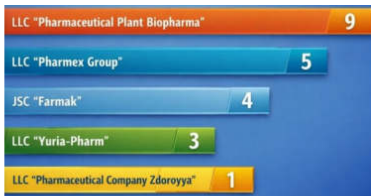
Fig. 1. Number of Ukrainian medicines in pre-filled syringes by manufacturers

Domestic drugs represented by 5 national manufacturers are shown in Fig. 1, where the largest share of the drug market (40.9%) belongs to LLC “FZ “Biopharma” (Bila Tserkva), which produces 9 items, LLC “Pharmex Group” (Boryspil) – 5 items (22.7%) and JSC “Farmak” (Kyiv) – 4 items (18.2%).